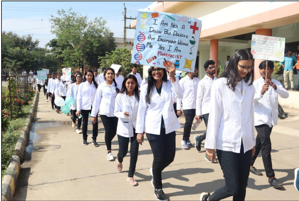
Image 3: Pharmacists awareness rally moving through various departments and sensitizing stakeholders